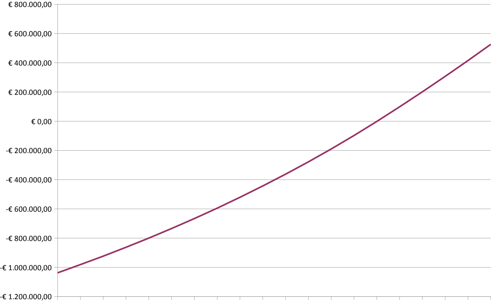
— Amortization (including interest 5%;3%) at annual acquittance